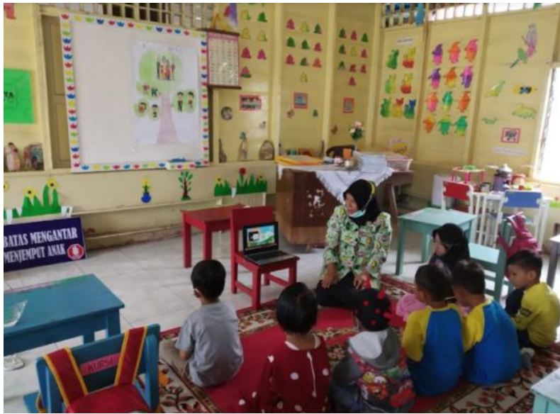
Figure 3. Children watching animated Minangkabau songs

The speech development of children involved in musical activities is affected in a positive way and their sensitivity to rhythm is increased. Children who engage in musical activities and use their bodies with music contribute a lot to psychomotor development and influence their feelings of success and positive beliefs. For that every teacher meeting creates an interesting song where the instrument of the song is different. Before singing the Minangkabau creations, the teacher makes an apperception to the children, this aims to reach the children's knowledge before learning