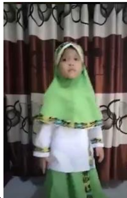
Picture 4. Children singing Minangkabau songs accompanied by Minusone

The speech development of children involved in musical activities is affected in a positive way and their sensitivity to rhythm is increased. Children who engage in musical activities and use their bodies with music contribute a lot to psychomotor development and influence their feelings of success and positive beliefs. For that every teacher meeting creates an interesting song where the instrument of the song is different. Before singing the Minangkabau creations, the teacher makes an apperception to the children, this aims to reach the children's knowledge before learning