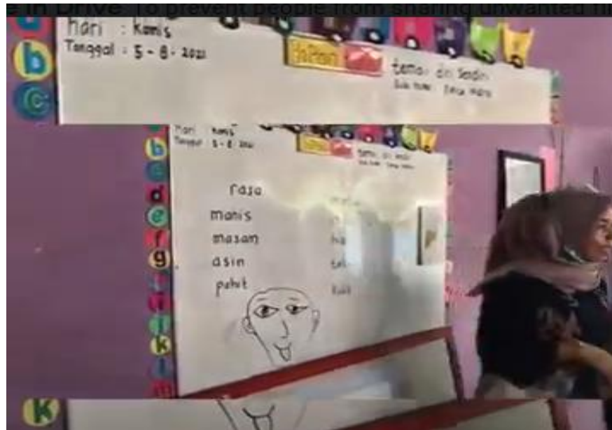
Figure 2. The teacher does apperception of animated songs according to the theme

The animation media of Minangkabau songs is very unique, where the Minangkabau song media is very popular among the Minangkabau community but is not suitable for early childhood, so Minangkabau creations are created which are presented and adapted to the aspects and development of speaking the child's mother tongue. the ability to speak the mother tongue includes aspects of pronunciation, vocabulary mastery, expression expression, and idea expression. According to Joan Bouza Koster (2012: 315) entitled Growing artist teaching the art to young children, namely: in making songs, you must pay attention to aspects of Break, Bridge, chords, lyrics and melodies that affect the creation of a song that sounds melodious. Song as a shaper of meaning, communication, and culture, builds a more complete understanding of music as a social and cultural practice. Music lessons study the technical aspects of singing such as awareness and voice development while singing. From Amanda Niland's opinion, songs and songs mean a lot to children, and music influences the culture of early childhood education settings. And the quality of music and songs affects children's language. Recognition that playing with a song will involve a totality of vocal, physical, linguistic, cognitive and emotional.