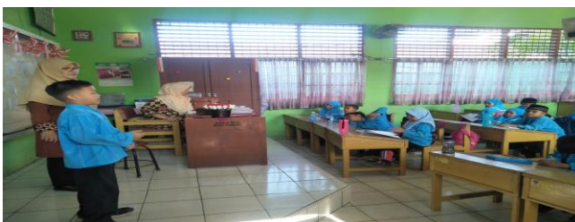
Foto 4. Students photos Back Story Telling Stories When Prophet That Reads

At its next meeting the students are given the opportunity 15 minutes to read a textbook that has been provided. After reading the book students are given the opportunity to retell the stories that have been read.