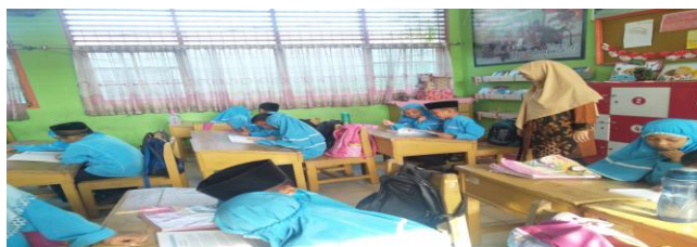
Foto 3. Photo Student Reading Textbook Literacy with Stories of the Prophet

At this meeting the lecturer gives understanding to the teacher that it is very important for learning in primary schools should budayakan improve the character of the students, because today a national character so easily influenced by outside cultures. Thus making the moral degradation in Indonesia. Literacy by using the story of the prophet are effective and efficient in changing the character of the students become positive character.