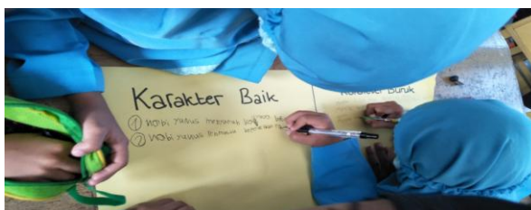
Foto 6. Photos Students In Determining Character Good and karakater Its Not Good

The teacher divides the students into 8 groups. Each group received a single cardboard to write on the discussion of both existing karate stance in the story of the prophet and karate are not well in the story they've read.