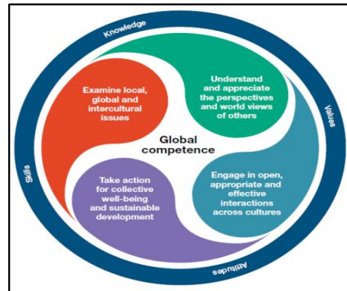
FIGURE 1: Dimensions of global competence

Global competence developed by the OECD (2018) has four dimensions namely knowledge, values, attitudes and skills. These four dimensions include four areas of competence, which are (i) examining local, global and international issues, (ii) understanding and appreciating others' views, (iii) engaging in aspects of openness, adaptability and cross-cultural interaction and (iv) taking collective action against well-being and sustainable development as shown in Figure 1.