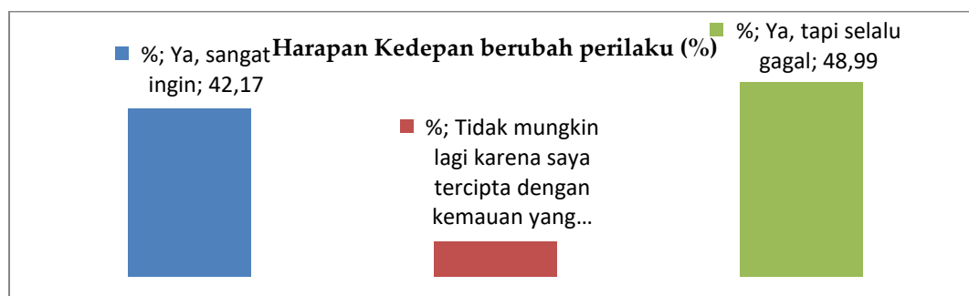
Figure 1. Frequency Distribution Of Respondents Based On Expectations Of Future Change Behavior

Access to medical services related behavior risk